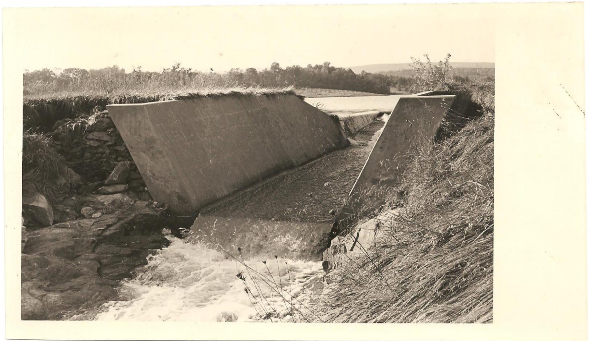
The working spillway for the Lake.