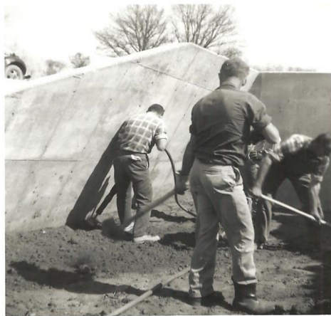
Building of the dam.