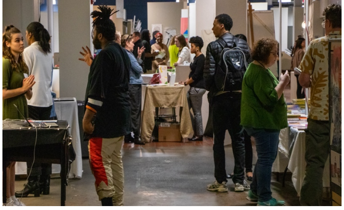
Fall 2019 Portfolio Event

The Discipline's Curriculum Committee devised a process that uses our capstone course, ARTT 263 Professional Practice for the Visual Artist, which is a program requirement for our three degrees, the A.A. in Art (618), A.F.A. in Studio Art (910), and A.F.A. in Graphic Design (902). This program required course is ideal in that its Student Learning Outcomes (SLO) provide the necessary measurable instruments for a robust assessment of our program learning outcomes. These course SLO include a requirement that students prepare a professional digital portfolio, develop a professional resume, and present and defend their