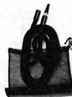
45' stretch exhaust hose with cuff, QuickDri tool and mesh carrying bag