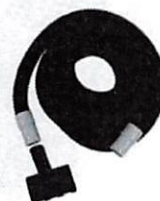
45' vacuum hose with gulper tool