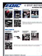
Laminated operation line card to mount on machine or on wall