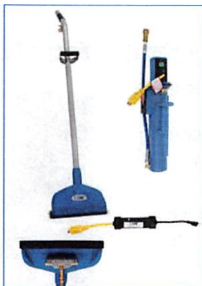
Part #: 705HR-TK