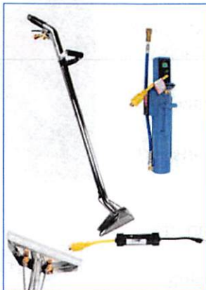
Part #: 705HR-GK