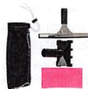
Mesh bag to carry mirror squeegee, microfiber cloth and other tools