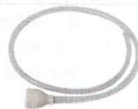
Sink fill adapter hose kit