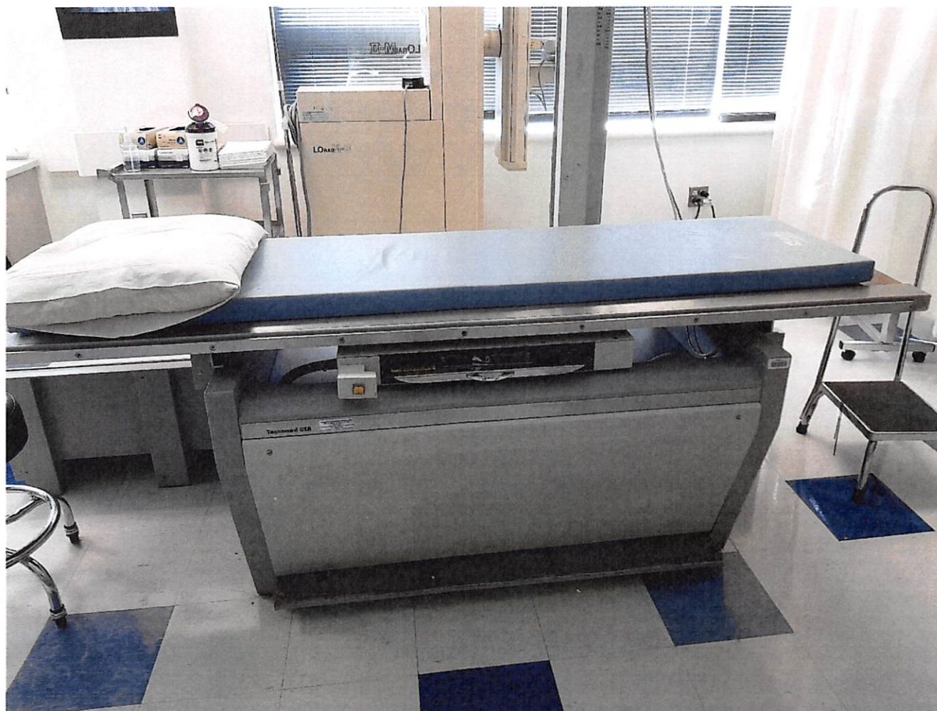
Existing Radiographic Table Tecnomed USA